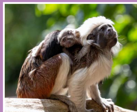
Cotton top tamarin