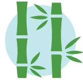
A piece of hollow bamboo 12 – 18mm wide

If you don't have bamboo at home, experiment with other items to see what is the most popular hotel.