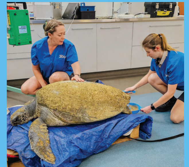
94kg turtle!

Sea turtle season has arrived — just in time for the school holidays!