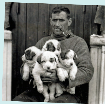
Tom Crean & pups aboard Endurance , 1914