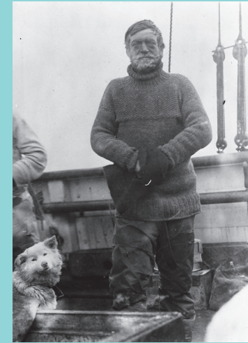
Ernest Shackleton aboard Nimrod , circa 1909.

In 2023, to mark 100 years since Ernest Shackleton's final polar expedition, the Antarctic Heritage Trust took a group of young people to the subantarctic island of South Georgia as part of its Inspiring Explorers™ Programme.