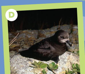
grey faced petrel