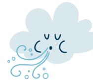
Ngā Hau - Wind