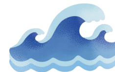
Nga Au - Currents