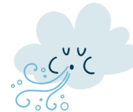
Nga Hau - Wind