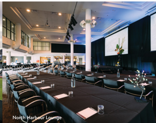
North Harbour Lounge