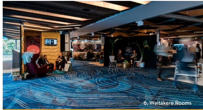
6. Waitakere Rooms