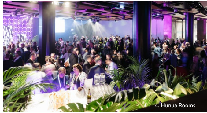
4. Hunua Rooms