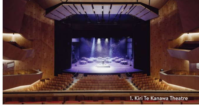
1. Kiri Te Kanawa Theatre