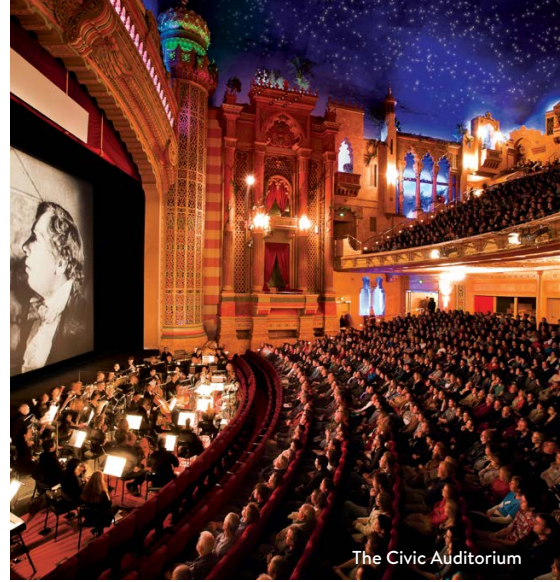
The Civic Auditorium

TAJ MAHAL ROOM - Rich colours and exotic décor, the Taj Mahal Room is a superb location for pre-show cocktails, work functions and banquet dinners.