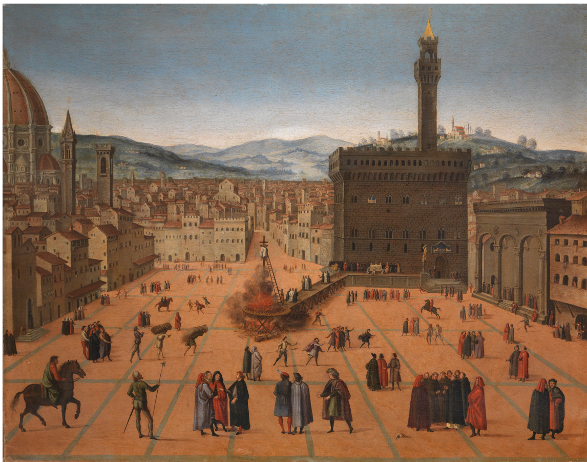
Florentine Painter after Francesco Rosselli The Execution of Savonarola and Two Companions at Piazza della Signoria 16th–17th century oil on canvas Florence, Galleria Corsini