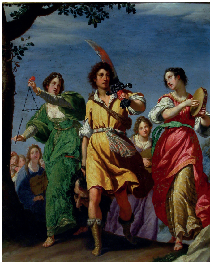
Matteo Rosselli The Triumph of David 1610 oil on copper Florence, Galleria Corsini