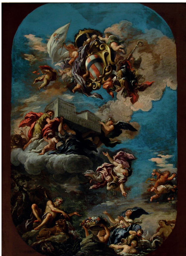
Anton Domenico Gabbiani Glorification of the Corsini Family: Sketch for the Ceiling Fresco of the Presentation Room of the Palazzo 1694–95 oil on canvas Florence, Galleria Corsini