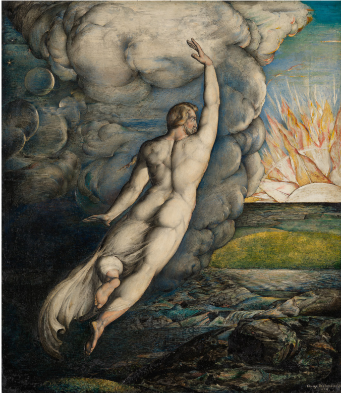
Image credit: George Richmond, The Creation of Light , 1826. Purchased 1986. Photo: Tate.

Auckland Art Gallery Toi o Tāmaki has today announced a new opening date for its upcoming international exhibition, Light from Tate: 1700s to Now . Opening Wednesday 1 March, this multi-sensory blockbuster exhibition from Britain’s premier art gallery features nearly 100 works by celebrated artists working across different media including painting, photography, sculpture, installation, drawing and the moving image.