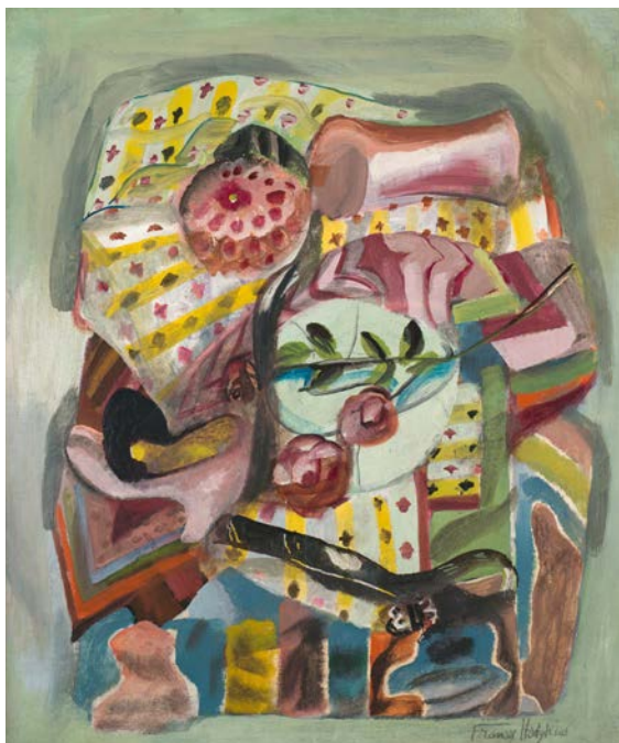
Frances Hodgkins Self Portrait: Still Life (circa 1935) Auckland Art Gallery Toi o Tāmaki, purchased 1963

'2019 marks the 150th anniversary of Hodgkins' birth, so we're taking every opportunity to celebrate her life and work.'