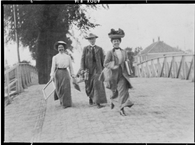
Frances Hodgkins (right)

New Zealand-born Frances Hodgkins (1869–1947) arrived in London in 1901 and, by the late 1920s, had become an important figure within British Modernism, exhibiting with avant-garde artists such as Ben Nicholson, Barbara Hepworth and Henry Moore. She travelled extensively throughout Europe until war made her settle in England where she spent the latter part of her long and highly productive working life. Combining natural talent, a unique vision and sheer determination, she established a successful career and became one of the most influential painters of her generation.