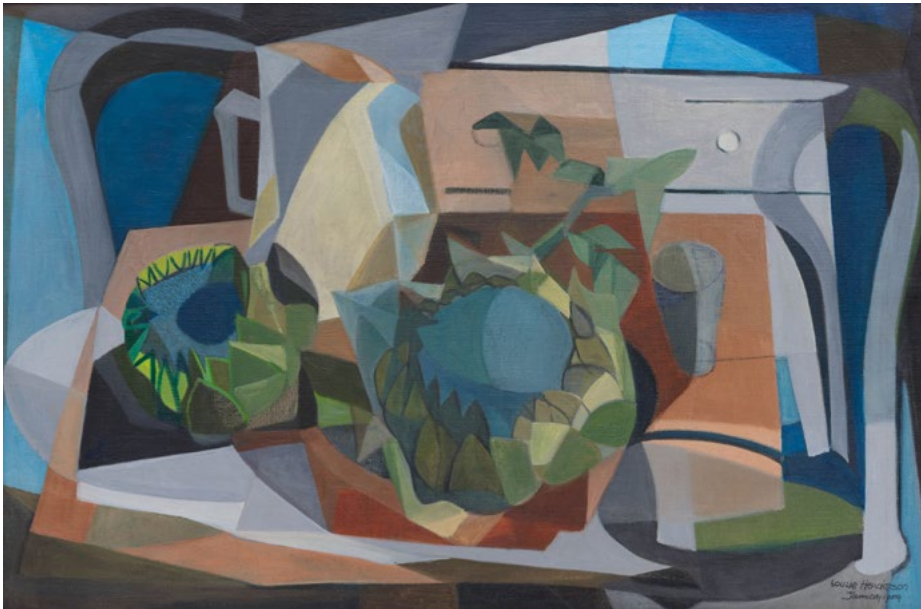
Louise Henderson Cubist still life 1954 Auckland Art Gallery Toi o Tāmaki, purchased 2019

Louise Henderson: From Life is the first major survey of work by French-born, New Zealand artist Louise Henderson (1902–1994) and opens at Auckland Art Gallery Toi o Tāmaki on Saturday 2 November. Featuring work from across Henderson's seven-decade career, the exhibition traces the development of the artist's bold and colourful abstract style.