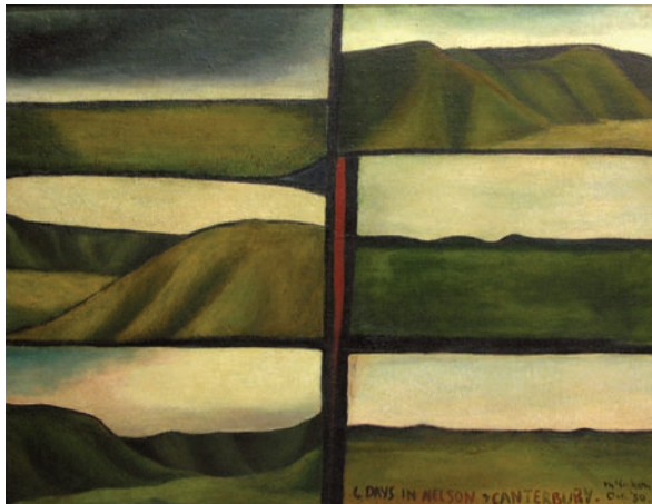
Colin McCahon, Six Days in Nelson & Canterbury , 1950. Oil on Canvas 885x1165mm Auckland Art Gallery Toi o Tamaki, gift of Colin McCahon through the Friends of the Auckland Art Gallery, 1978. Reproduced by courtesy of Colin McCahon Research and Publication Trust.

This is one of 95 works of Art gifted by the Friends to the Art Gallery Collection since 1954.