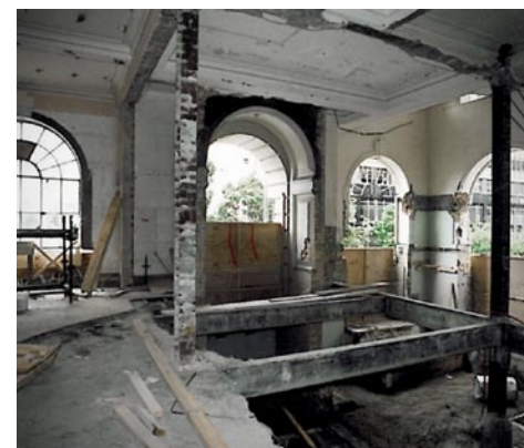
The NEW Gallery, pre-construction

The first part is celebrating the history of the NEW. There is a slide show of images showing how the building has changed and all the exhibitions that have been there. Then the main bulk of the show is a curators choice. I decided I didn't want to explore any particular themes... I'm interested in the way works of art connect people – people with people, and people with art. I wanted to try to encourage that.