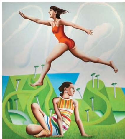
Ian Scott Sky Dash 1969–1970 Auckland Art Gallery Toi o Tāmaki Gift of the artist, 2004

Open from 3 July 2010 Auckland Art Gallery's exhibition Local Revolutionaries: Art & Change 1965–1986 brings together paintings, sculpture and works on paper, that convey a period in which new approaches to materials and form reflected a commitment to personal freedoms of expression. For many it was the first time New Zealand artists had the opportunity to devote themselves to full-time art making.