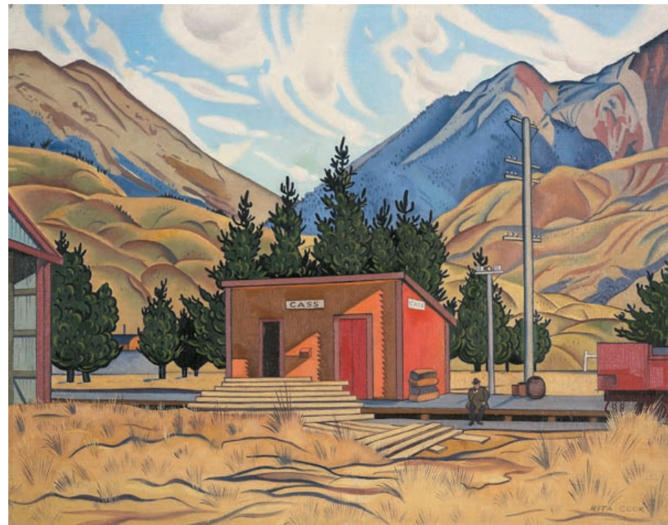
Rita Angus Cass 1936, oil on canvas on board, Christchurch Art Gallery Te Puna o Waiwhetu, purchased 1955.