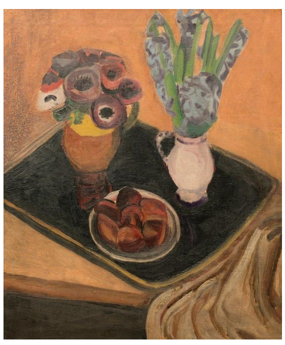
Credit: Frances Hodgkins, Still Life: Anemones & Hyacinths c1925, Auckland Art Gallery Toi o Tāmaki, image after 2015 treatment

A painting not seen by the public for 56 years will go on display at Auckland Art Gallery Toi o Tāmaki this weekend with the opening of Frances Hodgkins: Forgotten Still Life on Saturday 22 August.