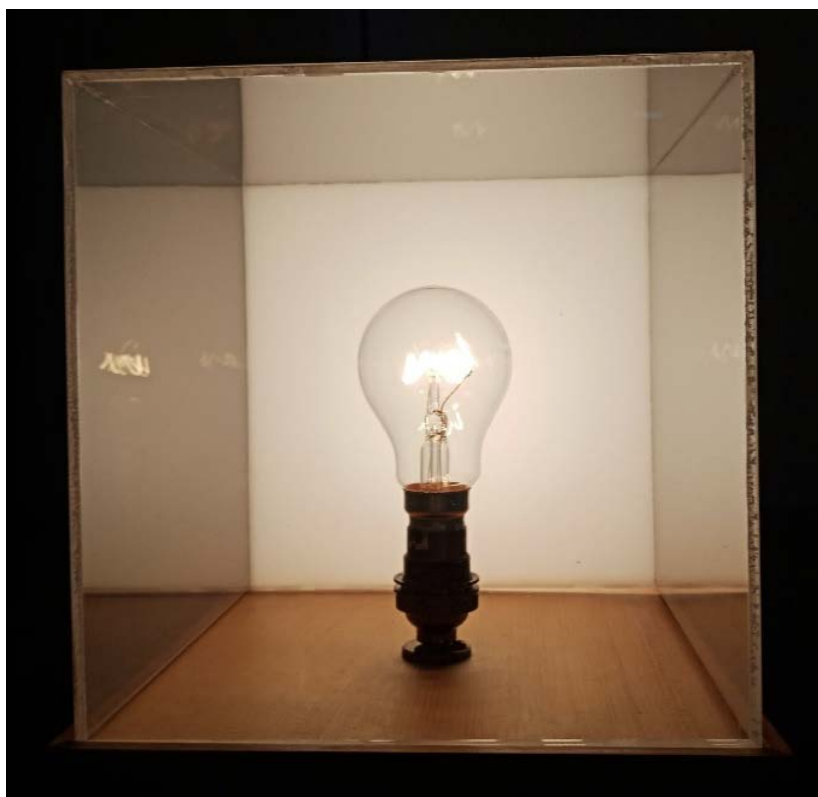
Bill Culbert Daylight to Nightlight Five Cubes to Black 1976.