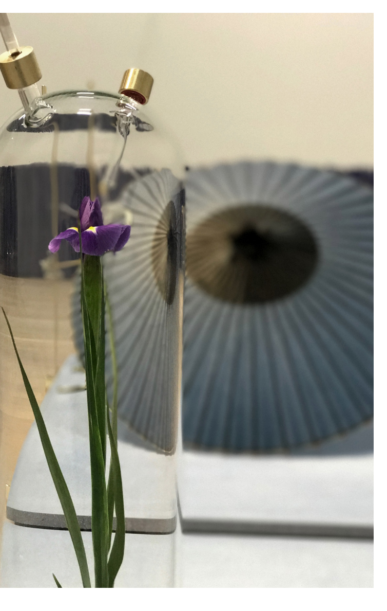
Dane Mitchell Iris, Iris, Iris, 2017 Installation view: MAM Project 024: Dane Mitchell. Mori Art Museum, Tokyo, 2017