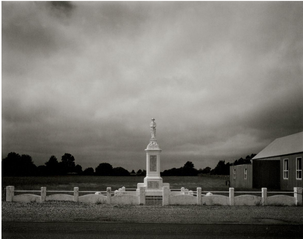
Image Credit: Laurence Aberhart, Brydone, Southland, 11 December 2010 , 2010, platinum, 470 x 590mm, courtesy of the artist

Auckland Art Gallery Toi o Tāmaki exhibits ANZAC: Photographs by Laurence Aberhart from 30 May to 6 December 2015.