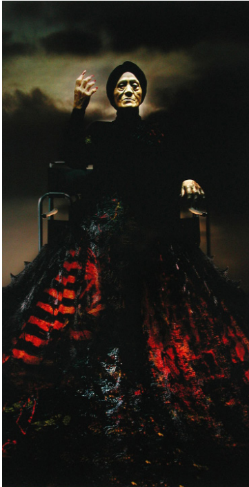
Image credit: Lisa Reihana Mahuika 2001 Auckland Art Gallery Toi o Tāmaki, purchased 2002. Courtesy of Artprojects © Lisa Reihana with thanks to Creative New Zealand.

Toi Tū Toi Ora: Contemporary Māori Art will be the largest exhibition in the 132-year history of Auckland Art Gallery Toi o Tāmaki.