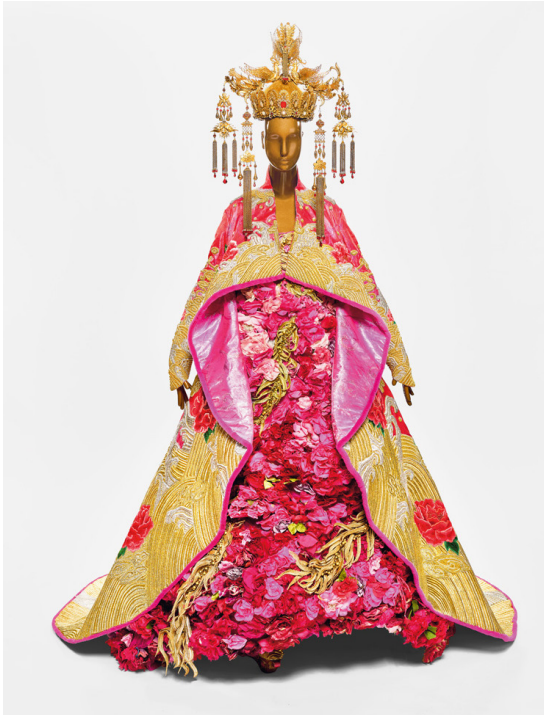
Guo Pei Collection: Legend of the Dragon, 2012.