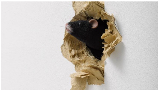
Ryan Gander The End , 2020, Auckland Art Gallery Toi o Tāmaki, purchased with assistance of the Lyndsay Garland Trust, 2021. Image © Ryan Gander; Courtesy Lisson Gallery.

Drawn from the Gallery's contemporary collection, this exhibition contemplates how artists respond to history and the world we inhabit. Portals & Omens: New Work from the Collection tracks artistic practice from home and across the globe with concepts of history and dystopia—an opulent and troubled culture of nature, time and language. Many of the works were made or acquired for the collection during the Covid-19 pandemic and, like Ryan Gander's small mouse and Berlinde De Bruyckere's archangel, ask that art reveals a common spirit or the importance of imaginary spaces.