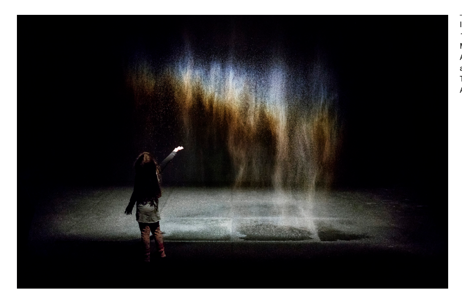
Image credit: Olafur Eliasson , Beauty , 1993; Installation view: Moderna Museet, Stockholm, 2015; Photo: Anders Sune Berg; Courtesy of the artist; neugerriemschneider, Berlin; Tanya Bonakdar Gallery, New York / Los Angeles. © 1993 Olafur Eliasson

Auckland Art Gallery is delighted to announce the upcoming exhibition Your curious journey by globally renowned artist Olafur Eliasson, marking the first solo showcase of the Icelandic-Danish artist in Aotearoa New Zealand.