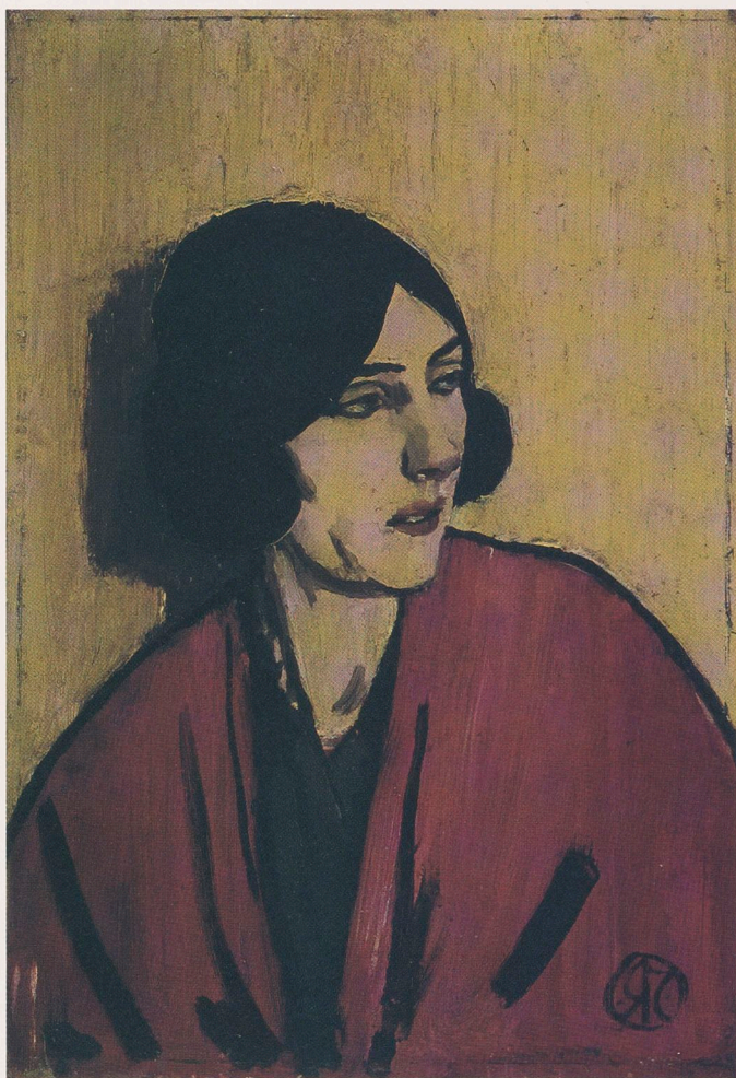
59 [Portrait of a dark-haired woman] c1914