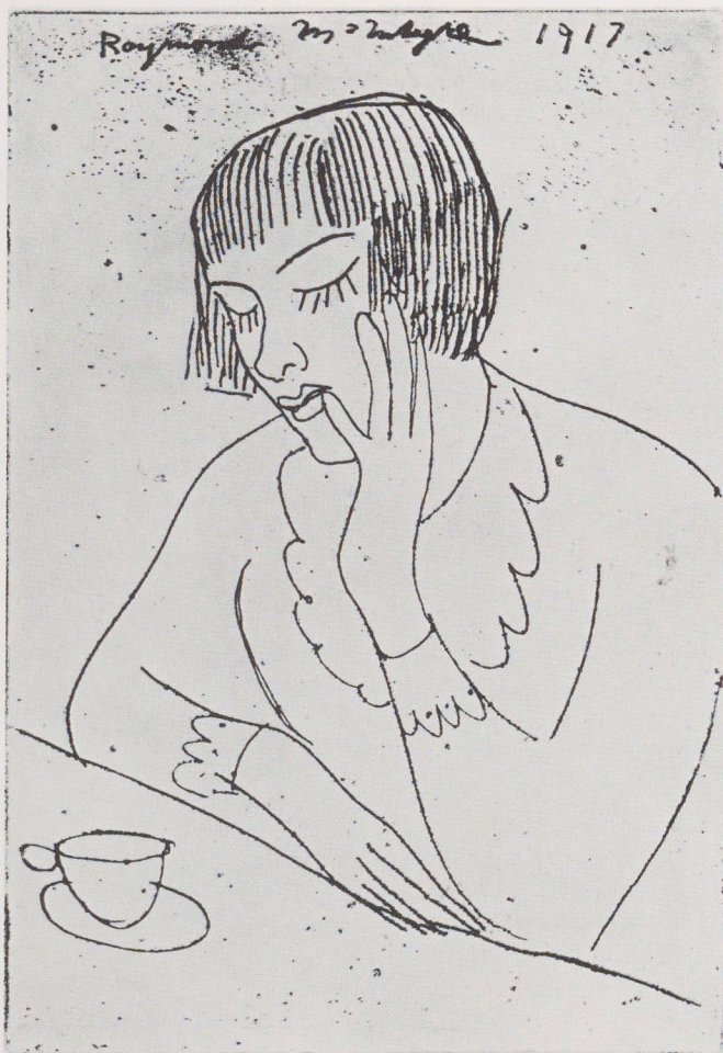
64 [Woman with teacup] 1917