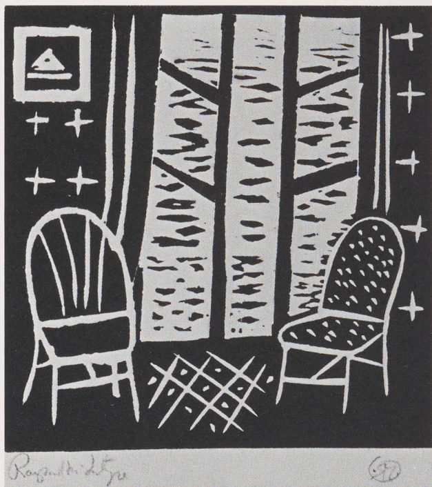
35 [French window] c1925

29 From a back window in Queensberry Place, London 1923 oil on panel Private collection, Kaikoura