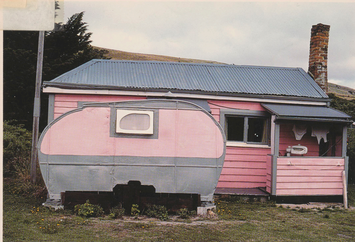
Pink Caravan, Otago Peninsula