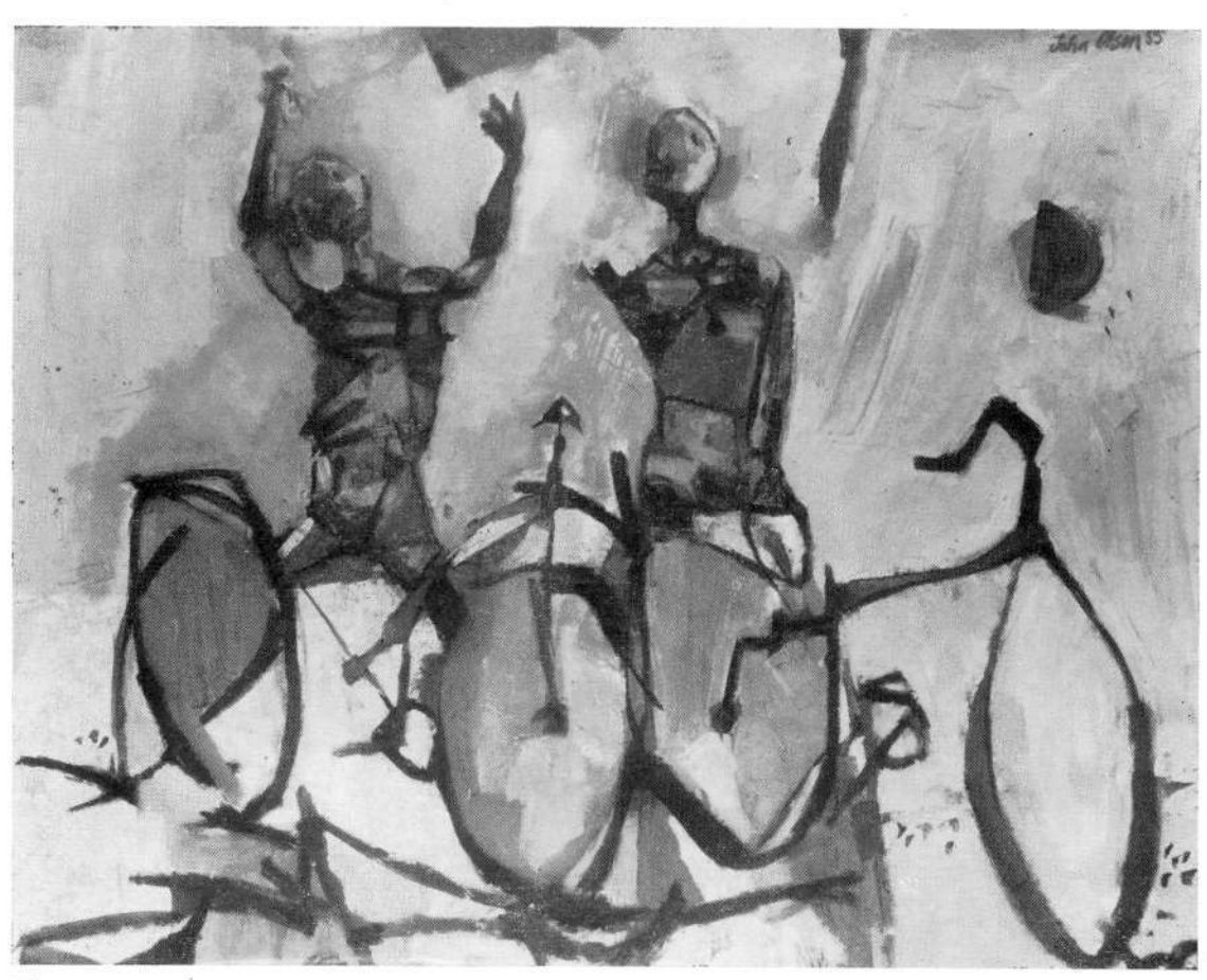
Plate 2 The Bicycle Boys Rejoice JOHN OLSEN (54)