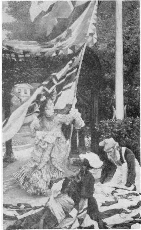
j. j. TISSOT

It is strange to note that Tissot in his last years painted only religious subjects and spent the last two years of his life in a monastery at Bouillon.