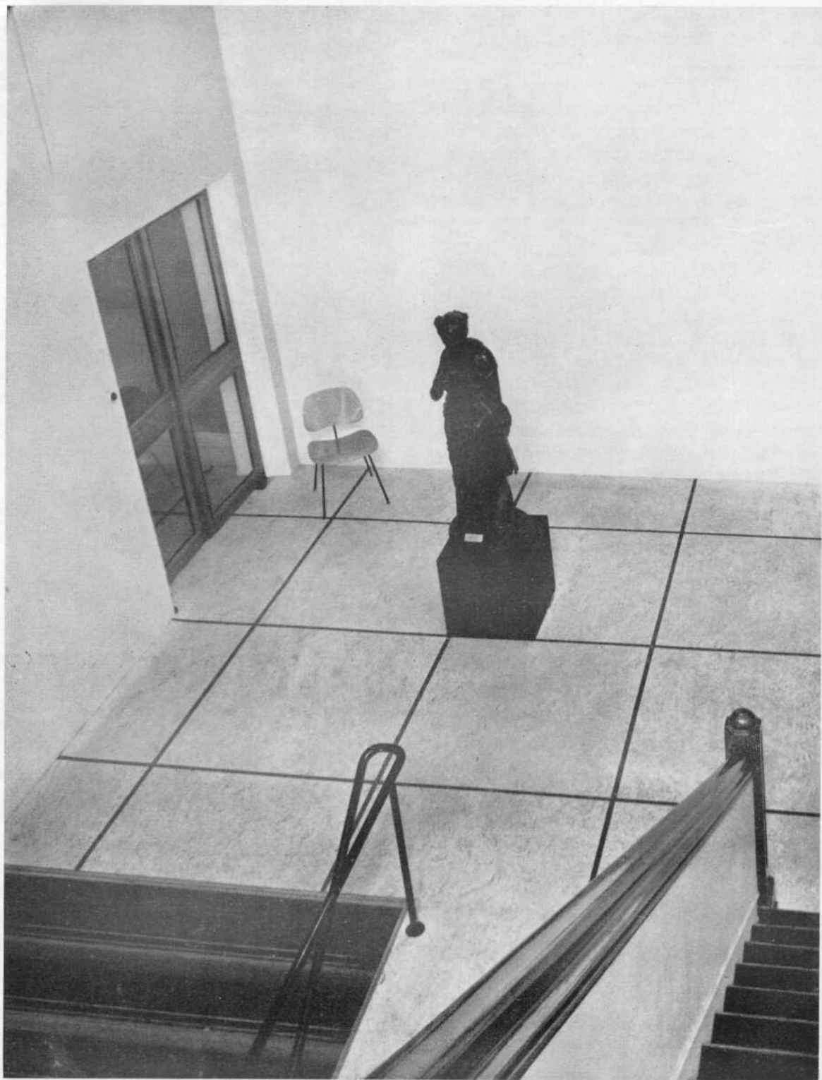
AUCKLAND CITY ART GALLERY