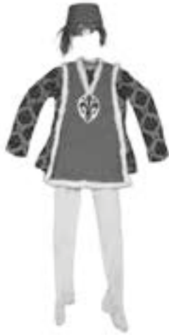
Aloisi from Livorno Italy