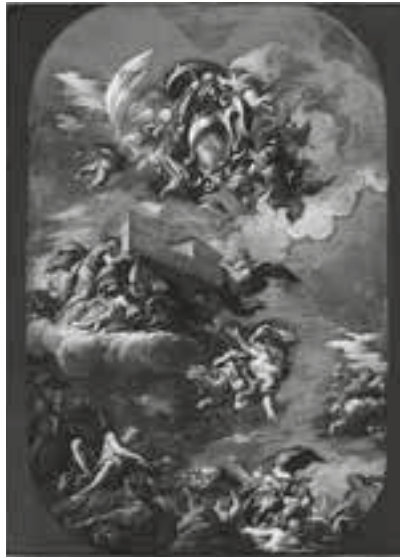
Anton Domenico Gabbiani (1652–1726) Italy