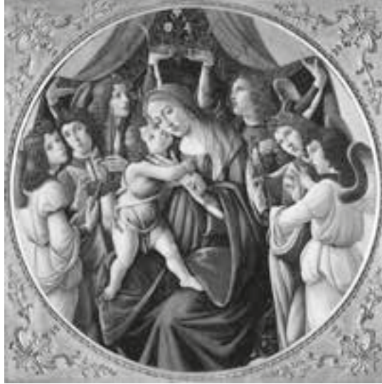
Sandro Botticelli and Workshop (circa 1445–1510) Italy