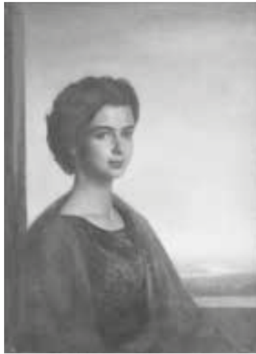
Luciano Guarnieri (1930–2009) Italy