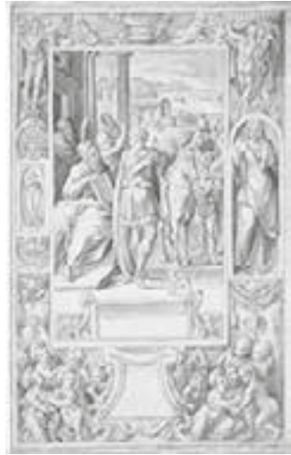
Giulio Clovio (1498–1578) Italy