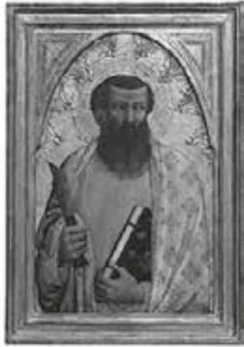
Antonio da Venezia (circa 1340–circa 1387) Italy