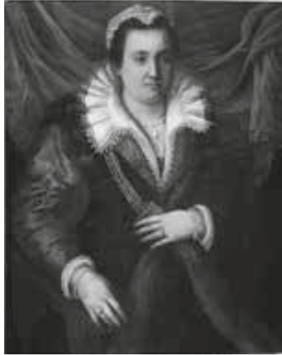
Alessandro Allori (1535–1607) Italy