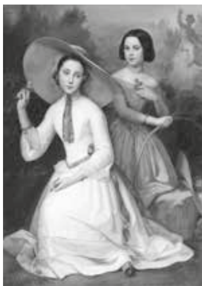
Natale Carta (1800–1888) Italy