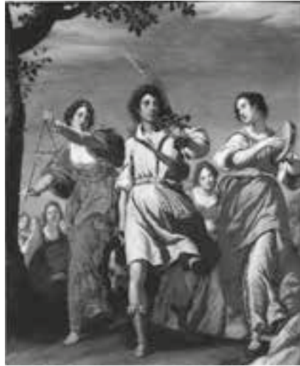
Matteo Rosselli (1578–1650) Italy