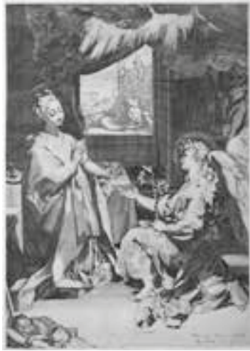
Federico Barocci (1535–1612) Italy