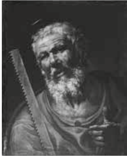
Tintoretto (1518–1594) Italy