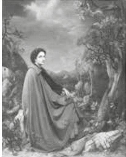
Pietro Annigoni (1910–1988) Italy