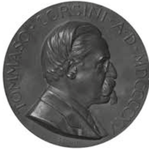
Dante Sodini (1858–1934) Italy