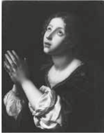
Carlo Dolci (1616–1686) Italy