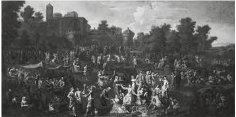
Agostino Tassi (1578–1644) Italy