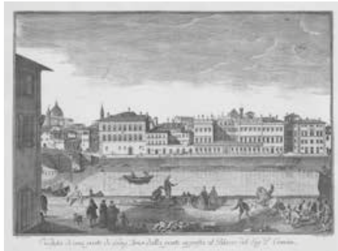
Giuseppe Zocchi (1716/17–1767) Italy