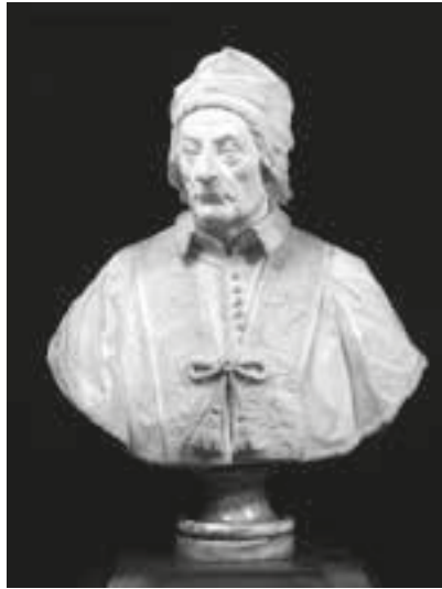
Francesco Maria Queirolo (1704–1762) Italy