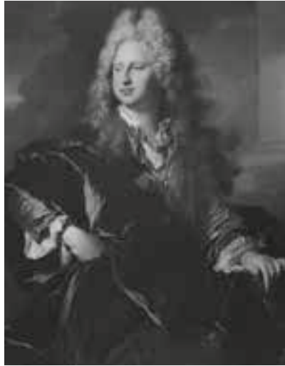
Hyacinthe Rigaud (1659–1743) France