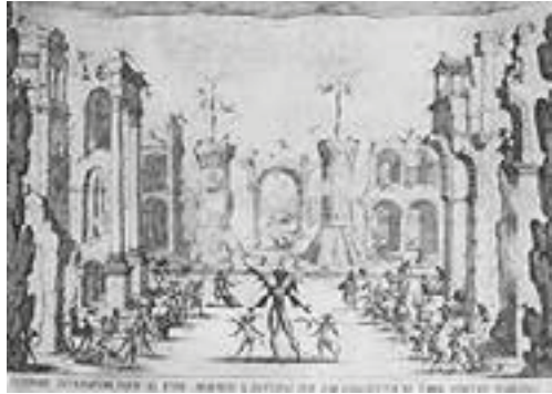
Jacques Callot (1592–1635) France