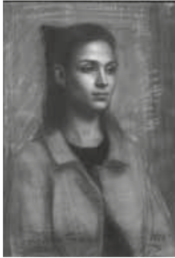
Luciano Guarnieri (1930–2009) Italy