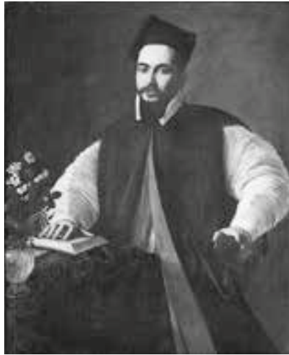
Michelangelo Merisi, known as Caravaggio (1571–1610) Italy