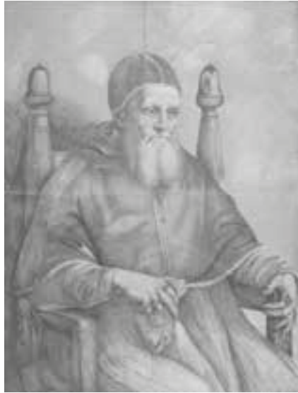
Raffaello Sanzio, known as Raphael (1483–1520) Italy