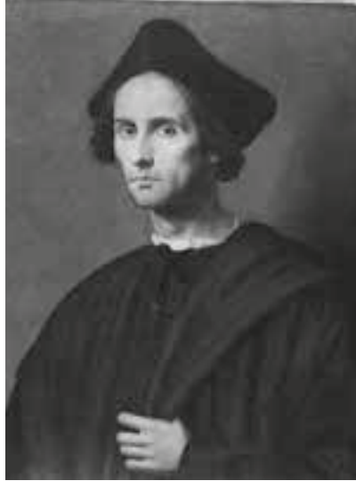
Ridolfo del Ghirlandaio (1483–1561) Italy