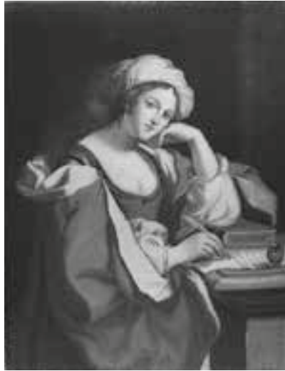
Unknown Maker Italy

after Giovan Francesco Barbieri, known as Guercino (1591– 1666) Italy