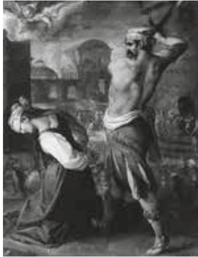
Jacopo Ligozzi (1547–1627) Italy