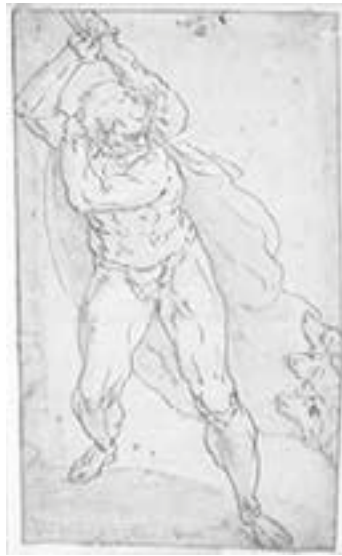
Luca Cambiaso (1527–1585) Italy