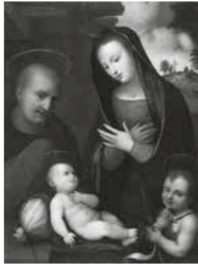
Fra Bartolomeo (1472–1517) Italy