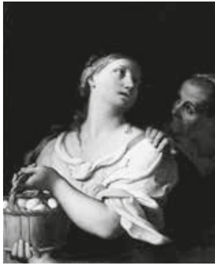
Giovanni Domenico Cerrini (1609–1681) Italy