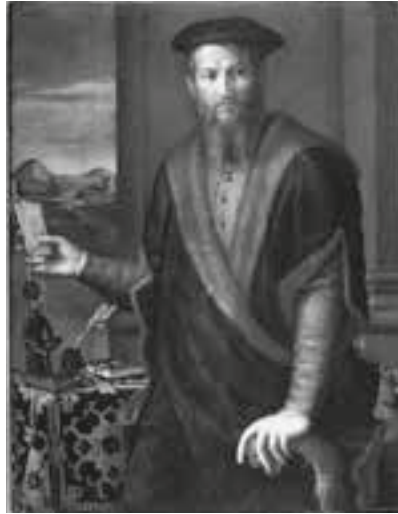
Pier Francesco Foschi (1502–1567) Italy