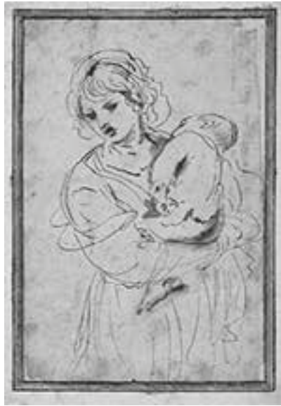
Giovan Francesco Barbieri, known as Guercino (1591–1666) Italy