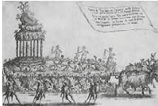
Jacques Callot (1592–1635) France