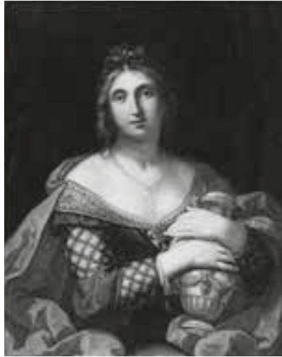
Unknown Artist (Circle of Guido Reni) Italy