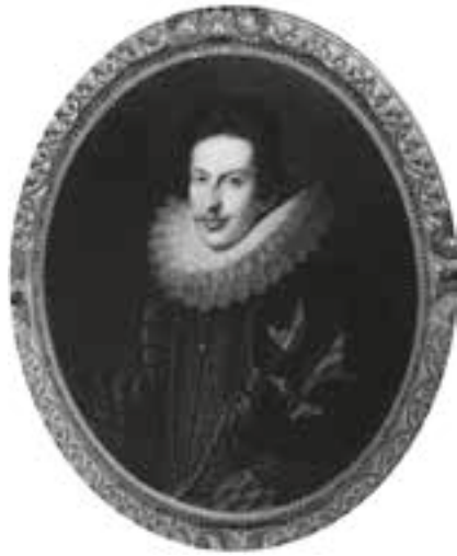
Justus Suttermans (1597–1681) Flanders