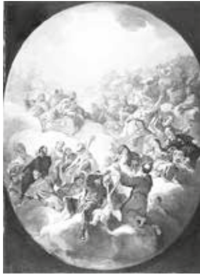
Luca Giordano (1634–1705) Italy