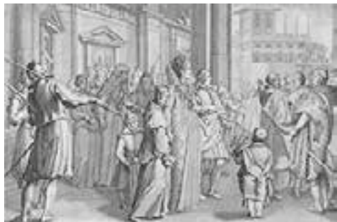
Jacques Callot (1592–1635) France