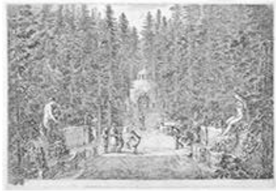
Stefano Della Bella (1610–1664) Italy