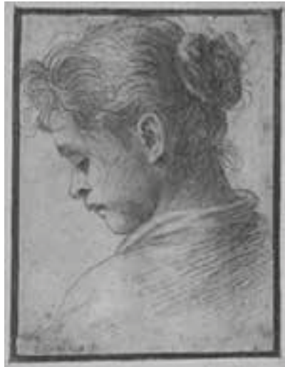
Agostino Carracci (1557–1602) Italy