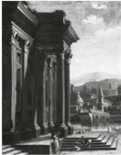
Niccolò Codazzi (1642–1693) Italy