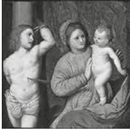
Paris Bordone (1500–1571) Italy