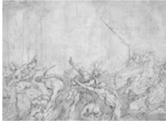
Ventura Salimbeni (1568–1613) Italy