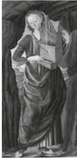
Giovanni Santi (circa 1435–1494) Italy