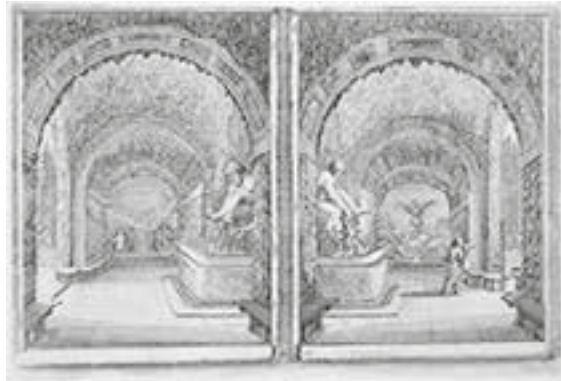
Stefano Della Bella (1610–1664) Italy