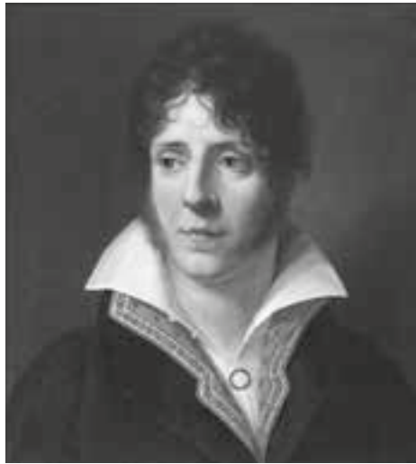
Pietro Benvenuti (1769–1844) Italy