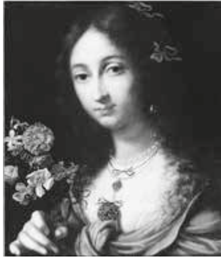
Cesare Dandini (1596–1657) Italy