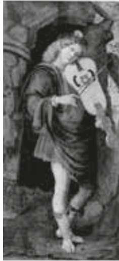
Giovanni Santi (circa 1435–1494) Italy