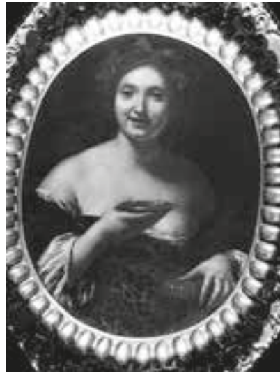
Vincenzo Dandini (1607–1675) Italy