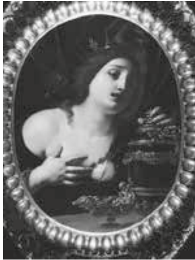
Cesare Dandini (1596–1657) Italy