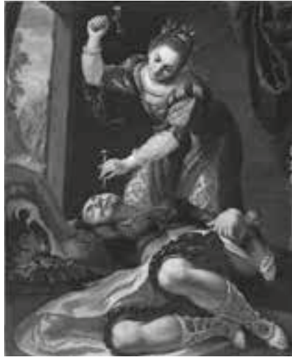
Matteo Rosselli (1578–1650) Italy