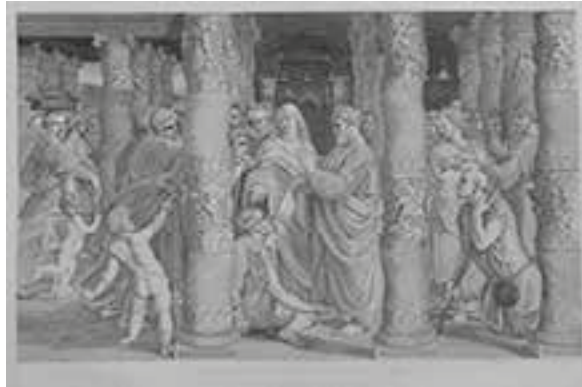
Thomas Holloway (1748–1827) England after Raphael (Raffaello Sanzio) (1483–1520) Italy