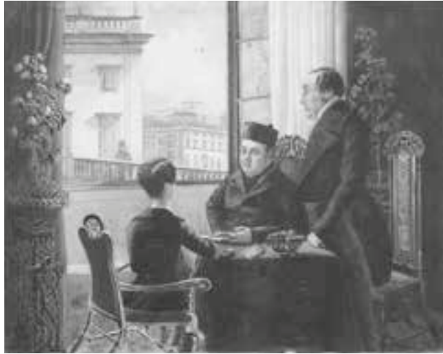
Luisa Scotto Corsini (1808–1888) Italy