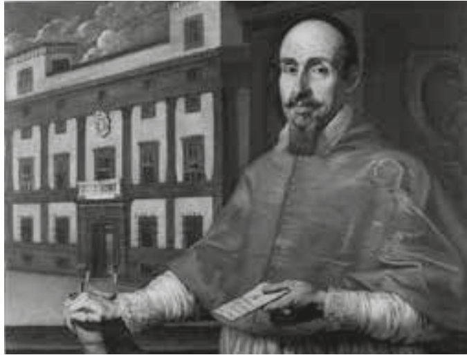
Domenico Zampieri, known as Domenichino (1581–1641) Italy