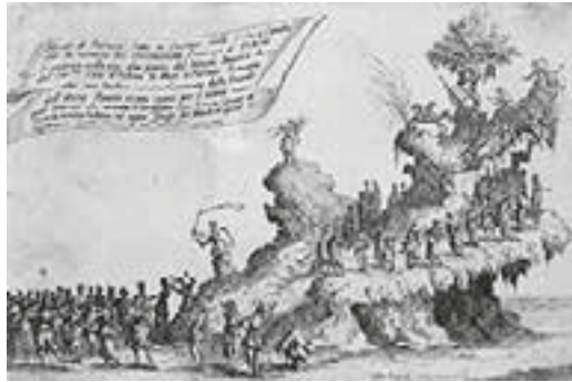
Jacques Callot (1592–1635) France