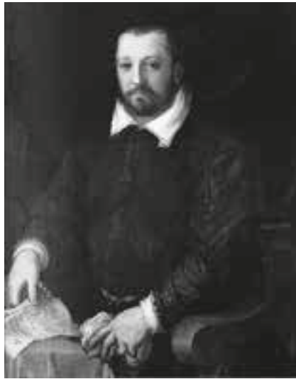
Alessandro Allori (1535–1607) Italy