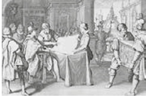
Jacques Callot (1592–1635) France