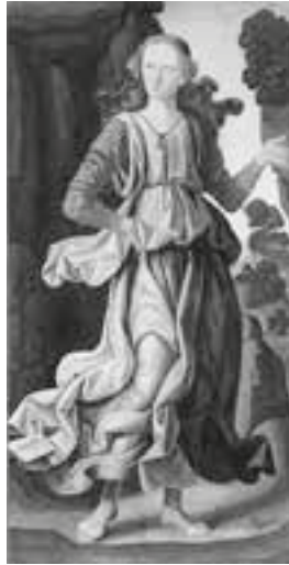
Giovanni Santi (circa 1435–1494) Italy