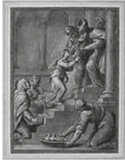
Anton Domenico Gabbiani (1652–1726) Italy