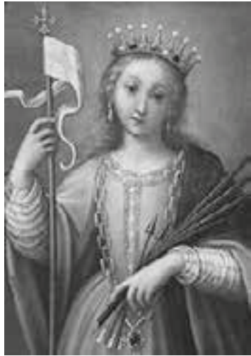
Giuseppe Cesari, known as Cavaliere d'Arpino (1568–1640) Italy