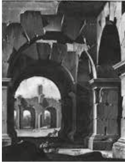
Niccolò Codazzi (1642–1693) Italy