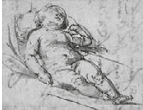
Guido Reni (1575–1642) Italy