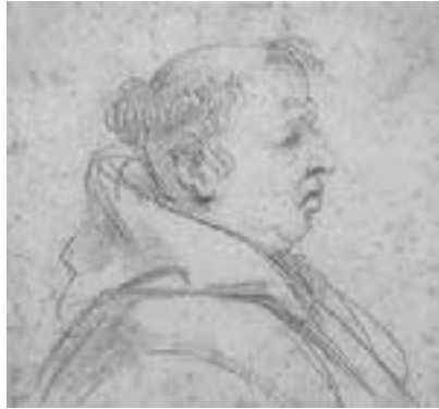
Pier Francesco Mola (1612–1666) Italy