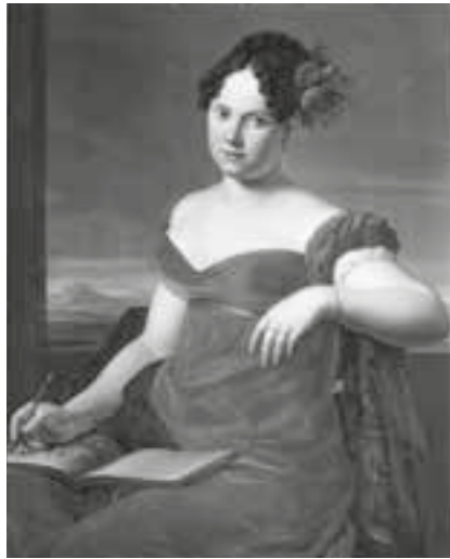
Pietro Benvenuti (1769–1844) Italy