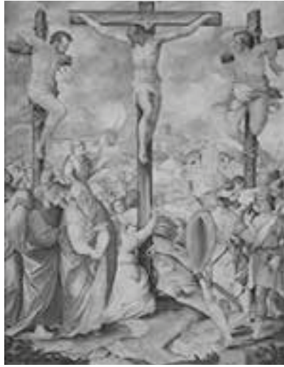
Giovanni Battista Castello (1547–1639) Italy