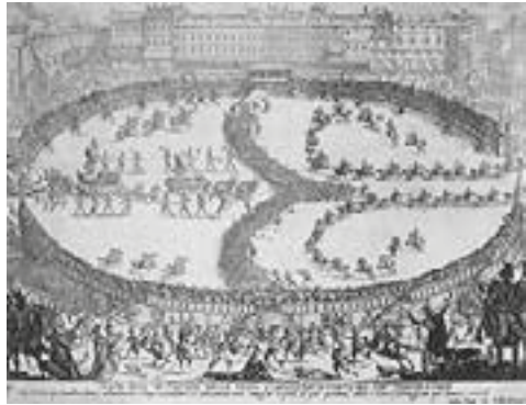
Jacques Callot (1592–1635) France