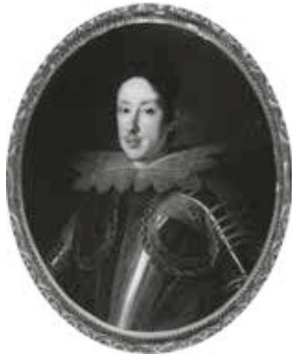
Justus Suttermans (1597–1681) Flanders