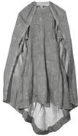
Aloisi from Livorno Italy