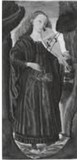
Giovanni Santi (circa 1435–1494) Italy